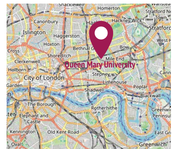
THE VENUE Oueen Mary University London, UK